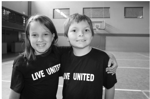
Thank you to NRG Media for creating a heart-warming campaign video featuring an extraordinary family touched by United Way.