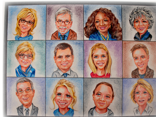
2020 Campaign Drive Chair Team Starting at top left, moving right: